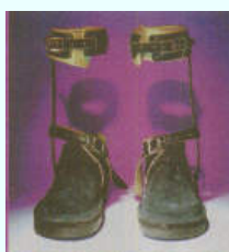
LEFT, ABOVE AND ABOVE RIGHT: The cover and selected photographs from the book. "In a world in which we expect perfection and in which technologies can change so much, disability can be seen as a kind of moral failure."